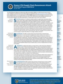
Kaseya VSA Supply Chain Ransomware Attack SBAR

In order to help the HPH sector better respond to cybersecurity events, the 405(d) Program established a Tiger Team, which consists of 405(d) Task Group members that discuss time-sensitive cybersecurity alerts and events that are relevant to the HPH sector. The Tiger team develops an SBAR Situation, Background, Assessment, and Recommendation product that is tailored specifically for the HPH sector. The Recommendations are all pulled from the HICP Publication. This is a new 405(d) product and in 2021, we released three of these quick turnaround reports.