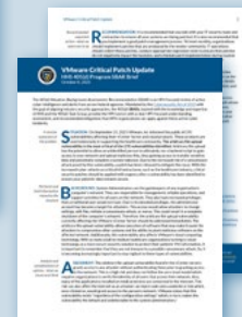
VMware Critical Patch Update SBAR